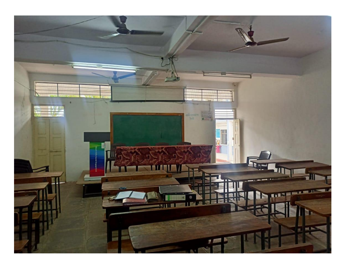
ICT Lecture Hall